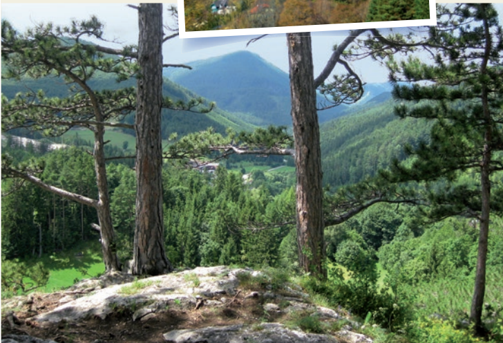
The Hausstein offers a panoramic view