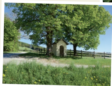
The chapel at Jagasitz/Kreuth