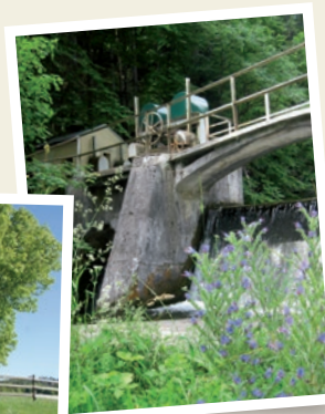
Dam wall near the water reservoir at the end of Myra waterfalls