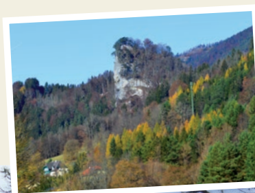
View towards Hausstein

In earlier times, this mountain with an approximately 60 m high rock face, together with the so-called "Hirschwände" ("deer walls"), represented an insurmountable obstacle for intruders. That is why it also served as a place of refuge. Nowadays you can often see sport climbers on the steep rock faces. The viewpoint Hausstein is also easily accessible from the back.