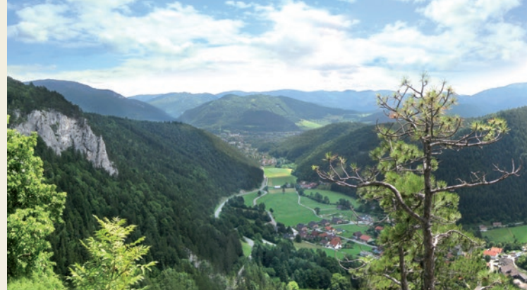
View from Hausstein